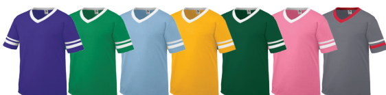
PURPLE/ WHITE 450 KELLY/ WHITE 340 LIGHT BLUE/ WHITE 460 GOLD/ WHITE 245 DARK GREEN/ WHITE 438 PINK/ WHITE 453 GRAPHITE/ RED/ WHITE 213