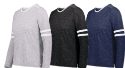
ATHLETIC HEATHER/WHITE 152 BLACK HEATHER/WHITE 56N NAVY HEATHER/WHITE 57N