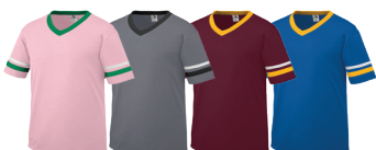
LT. PINK/ KELLY/ WHITE 682 GRAPHITE/ BLACK/ WHITE 195 MAROON/ GOLD/ WHITE 390 ROYAL/ GOLD/ WHITE 613