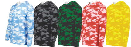
GLACIER COL BLUE 76V GLACIER BLACK 87V GLACIER DK GREEN 88V GLACIER SCARLET 86V GLACIER GOLD 85V