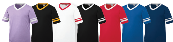
LIGHT LAVENDER/ WHITE J68 BLACK/ GOLD 421 WHITE/ RED 225 BLACK/ WHITE 420 RED/ WHITE 400 ROYAL/ WHITE 280 NAVY/ WHITE 301