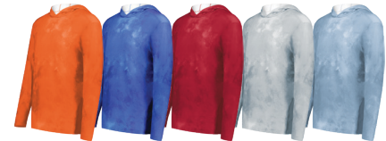
ORANGE CLOUD PRINT 68T ROYAL CLOUD PRINT 63T SCARLET CLOUD PRINT 66T SILVER CLOUD PRINT 69T STORM CLOUD PRINT 70T