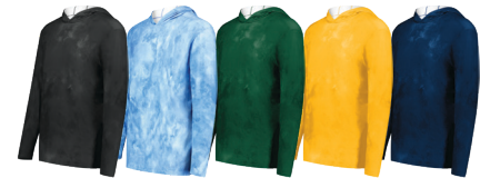
BLACK CLOUD PRINT 65T COL BLUE CLOUD PRINT 67T DK GREEN CLOUD PRINT 62T GOLD CLOUD PRINT 61T NAVY CLOUD PRINT 64T