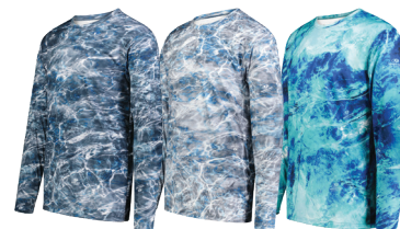
MO ELEMENTS AGUA BLACKFIN 86T