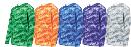
SHOCKWAVE KELLY 72V SHOCKWAVE ORANGE 73V SHOCKWAVE ROYAL 75V SHOCKWAVE PURPLE 74V SHOCKWAVE SILVER 77V

Due to dyes used for creating this garment, dye migration is likely if screen printing or using certain heat transfers without preventive steps. You are advised to consult your Screen Print ink or Heat Transfer provider before decorating if you are unsure of the proper steps for decoration.