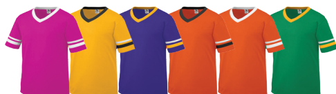
POWER PINK/ WHITE 468 GOLD/ BLACK/ WHITE 249 PURPLE/ GOLD/ WHITE 615 ORANGE/ BLACK/ WHITE 322 ORANGE/ WHITE 320 KELLY/ GOLD/ WHITE 344