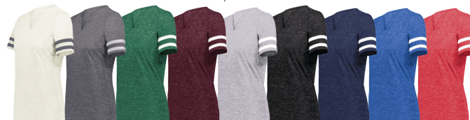
BIRCH HEATHER/CARBON HEATHER 112 CARBON HEATHER/ATHLETIC HEATHER 019 DARK GREEN HEATHER/WHITE 86E MAROON HEATHER/WHITE 61N ATHLETIC HEATHER/WHITE 152 BLACK HEATHER/WHITE 56N NAVY HEATHER/WHITE 57N ROYAL HEATHER/WHITE 58N SCARLET HEATHER/WHITE 59N