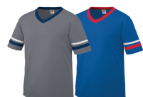
GRAPHITE/ NAVY/ WHITE 212 ROYAL/ RED/ WHITE 115