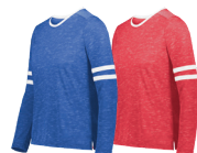
ROYAL HEATHER/WHITE 58N SCARLET HEATHER/WHITE 59N