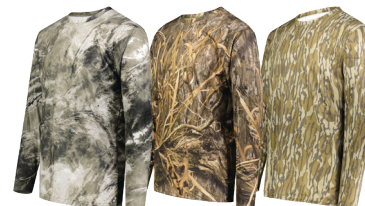
MO ELEMENTS WAKEFORM GALE 88T