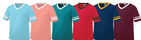
AQUA/ WHITE Y06 CORAL/ WHITE Y05 TEAL/ WHITE 331 RED/ BLACK 407 NAVY/ GOLD 302 MAROON/ WHITE 380