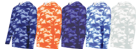
GLACIER NAVY 84V GLACIER ORANGE 83V GLACIER PURPLE 82V GLACIER ROYAL 81V GLACIER SILVER 80V