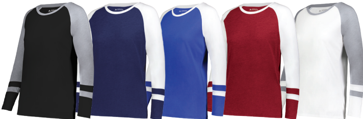
BLACK/ GREY HEATHER 92T