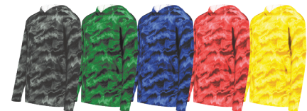
SHOCKWAVE GRAPHITE 86V SHOCKWAVE DK GREEN 87V SHOCKWAVE NAVY 88V SHOCKWAVE SCARLET 70V SHOCKWAVE GOLD 71V